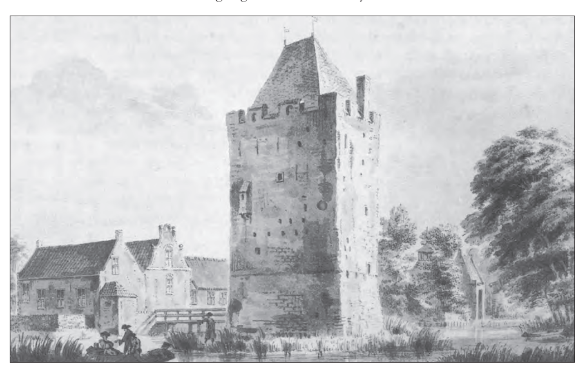
Plate I. Lunenburg, one of the many (in origin) thirteenth-century fortified houses (tower houses) in the medieval Langbroekerwetering reclamation area (drawing by Abraham de Haen, 1725).

estates owned by ecclesiastical institutions and the Bishop of Utrecht, the territorial ruler of the area. The managers of these estates were the main actors in the reclamation of the neighbouring wetlands, acting as the medieval equivalents of present-day developers (locatores). All western Dutch peat bog reclamations studied by de Bont (2008) that were initiated by the bishop proved to have been executed by locatores, who received their commission in so-called 'cope' (purchase) contracts issued by the bishop (van der Linden 1955; Borger 1992). In the Langbroekerwetering area, locatores demonstrably received land and privileges in both newly reclaimed and 'old' land (van Doesburg 2011; in prep.). Other tower and manor houses were built by descendants of settlers who had succeeded in making their fortune and gaining prestige. This suggests that castle construction in this specific reclamation area may represent both the material expression of an existing elite and the physical manifestation of a newly formed one.